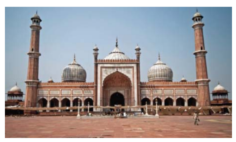
Majid Mosque, Delhi, India

land to marry into the aristocracy – sometimes for love and other times to rescue England's great estates and/or to give status to their families back home. Their de-