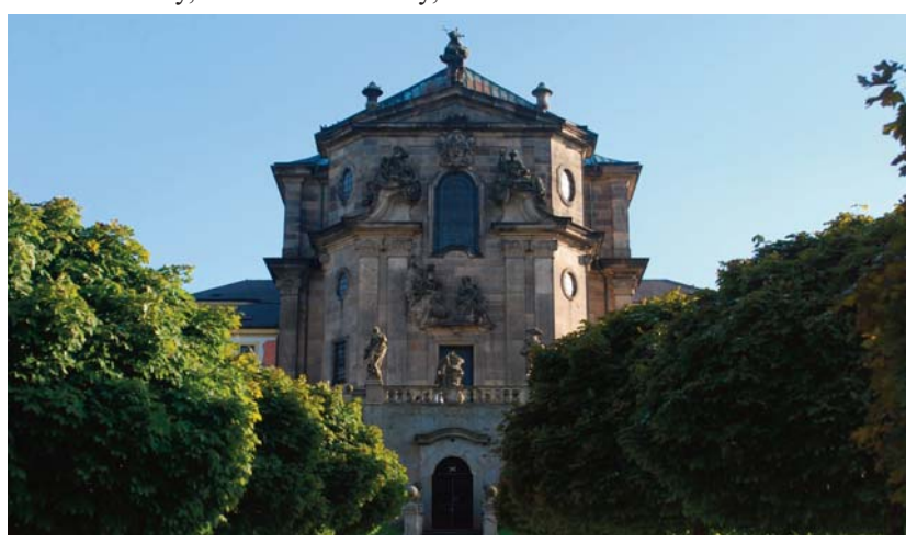
The Czech Academy at Kuks Centre, Prague, home to the UU ministerial and lay training modules.